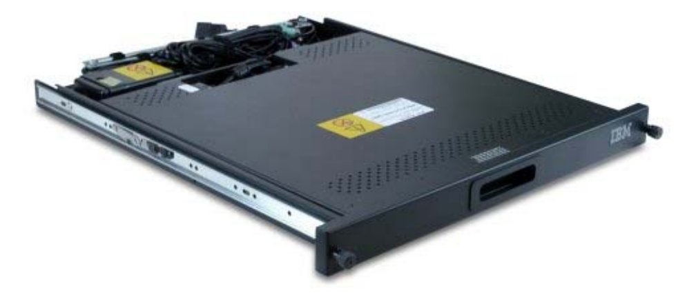
Figure 3. IBM 1U 19-inch Flat Panel Console Kit

Figure 3 shows the IBM 1U 19-inch Flat Panel Console Kit in the closed position.